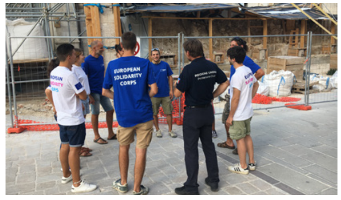
Helping protect cultural heritage, Norcia, Italy, September 2017

A number of volunteers from all over Europe will, between 2017 and 2018, participate in three different Solidarity Corps projects in central Italy, helping with the protection and strengthening of the tangible and intangible heritage in the regions affected by devastating earthquakes in 2016.